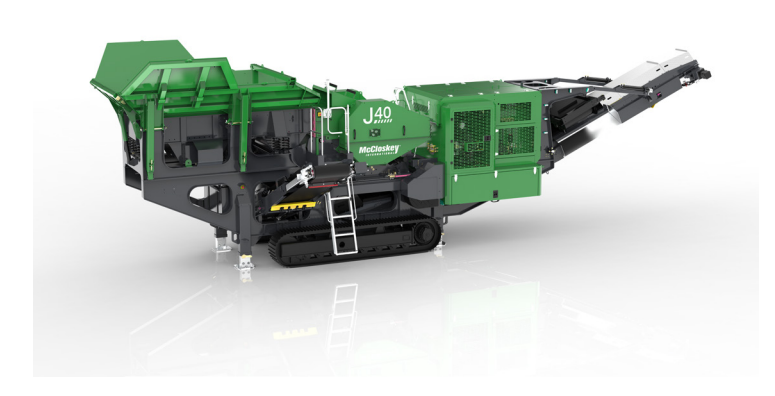
At 2.5 metres wide, the J40 jaw crusher is ideal for applications that require a high degree of mobility.

Maximum productivity is delivered through the enhancements to the deep jaw box, including a faster jaw speed and a larger gap between the crusher discharge and main conveyor feedboot. The J40 retains the core values expected in a full size McCloskey jaw crusher, including high capacity production and heavy duty build, packaged for efficiency and mobility.